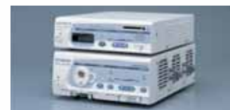
VISERA Video System