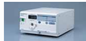
OTV-SI Compact OFFICE Video System

Specifications, design and accessories are subject to change without any notice or obligation on the part of the manufacturer.