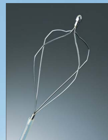
Available in hard wire and soft wire FG-402Q/403Q