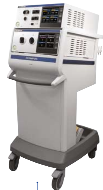
Surgical Tissue Management System with energy cart TC-E400

Specifications, design and accessories are subject to change without any notice or obligation on the part of the manufacturer.